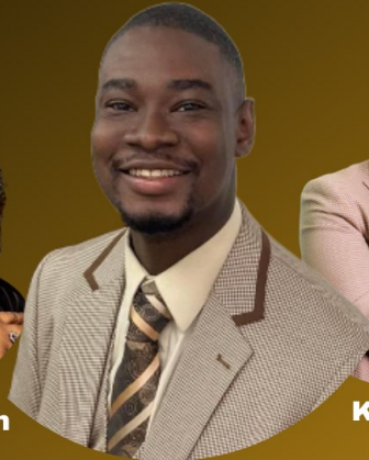
Minister Delroy White